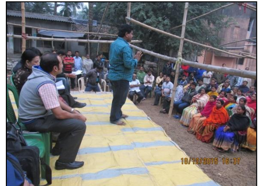
Councilor of Ward 142 addressing the crowd during Community Consultation at Indira Udyan, Ward No. 142